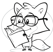
Read a book.