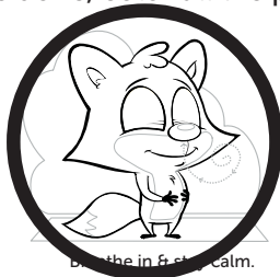
Breathe in & stay calm.