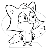
Whistle a song.