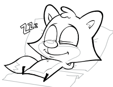
Take a nap.