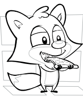
Eat some pizza.