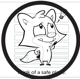
Look out of a safe place.