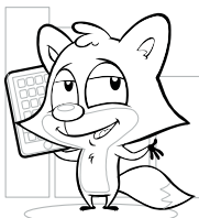
Chat with a friend.